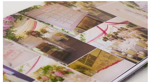
Albums and Photobooks