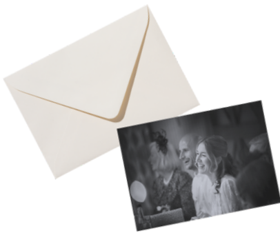
Thank You Cards

We offer a range of wedding albums and photobooks to suit all budgets and styles. From Italian leather albums printed and bound in Italy, to pocket sized photobooks designed by you on our website. The Fitzgeralds Team is always on hand to help and advise.