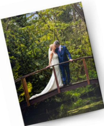
Wall Art including canvases, collages and framed prints